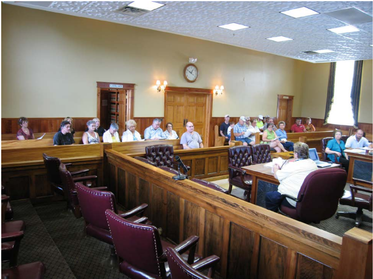
Public CEDS Outreach in Braxton County, West Virginia

Since 1999, the Council has participated and invited other local citizens to participate in the development of the CEDS. This year's process has used the information and enthusiasm generated from previous forums, projects, and/or meetings to improve development strategies of the seven county area in east central West Virginia. A more focused and more evolved vision of a regional future has resulted. The CEDS Committee meetings and survey instrument evaluations have helped to identify & describe concerns, needs, opportunities, assets, and the Council/Staff's effectiveness for this Region.